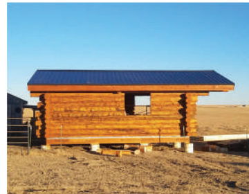
...and one happy owner.