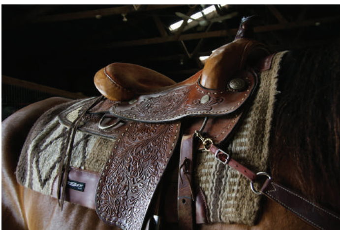
Saddling up for a morning ride