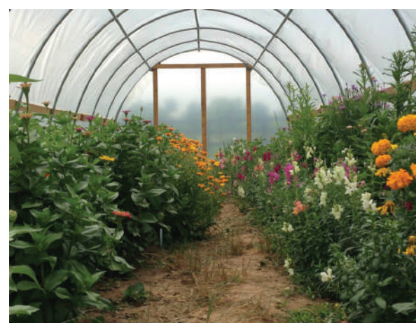
A hoop house-style garden ensures that crops don't lose out to an early winter