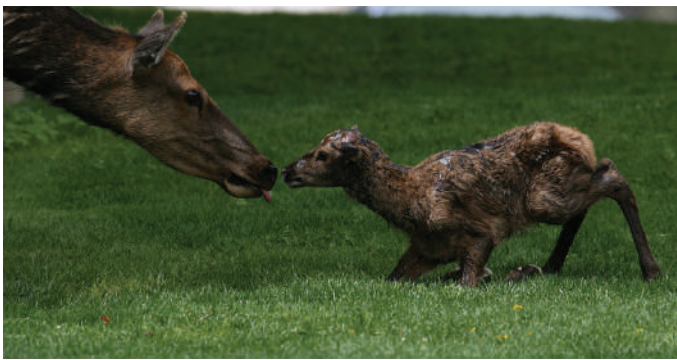
A baby elk's first day