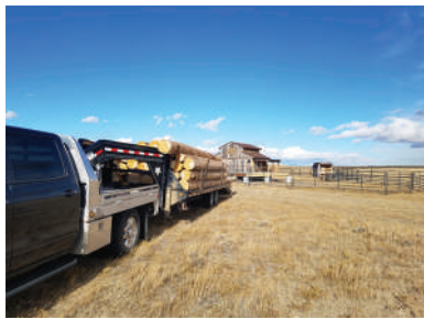
Special delivery! One log cabin...