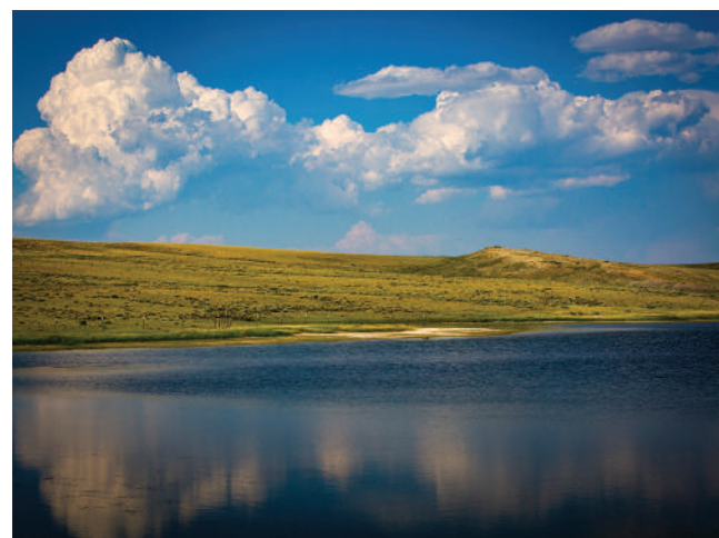
Come for the fishing, stay for the tranquility