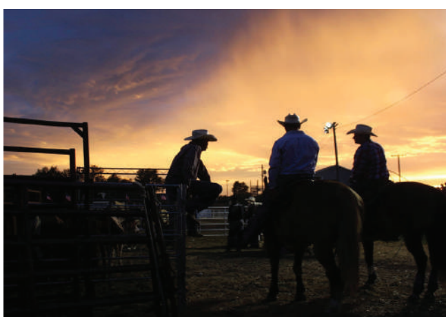
A beautiful Wyoming sunset calls the end of the workday