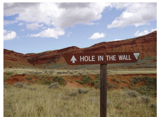
Butch Cassidy's former hideout still hasn't lost its charm