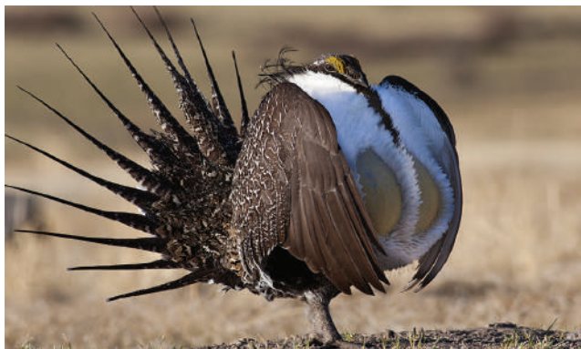
Native sage grouse