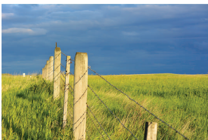
Big skies have no competition here.